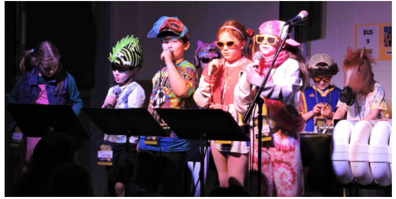
The Junk 2 Funk program culminated in a rocking concert.